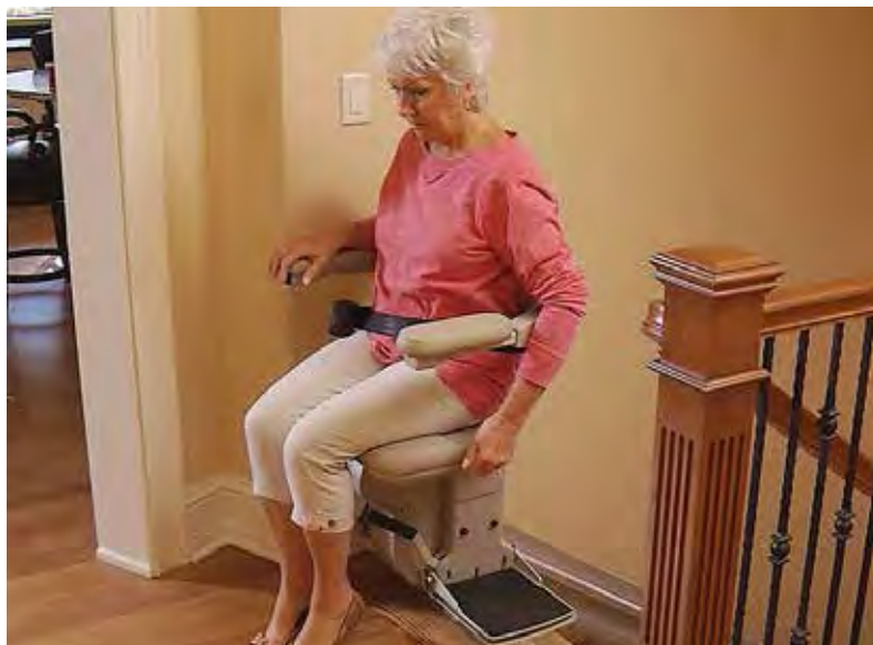
Offset swivel seat makes it easy to get on/off.