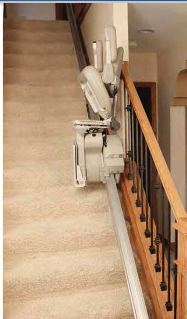
Compact design for open space on stairs.