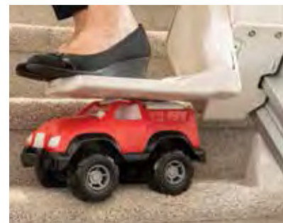
Sensors ensure safety.