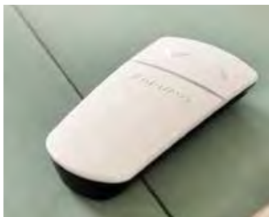
Two wireless call/sends allow remote control access.