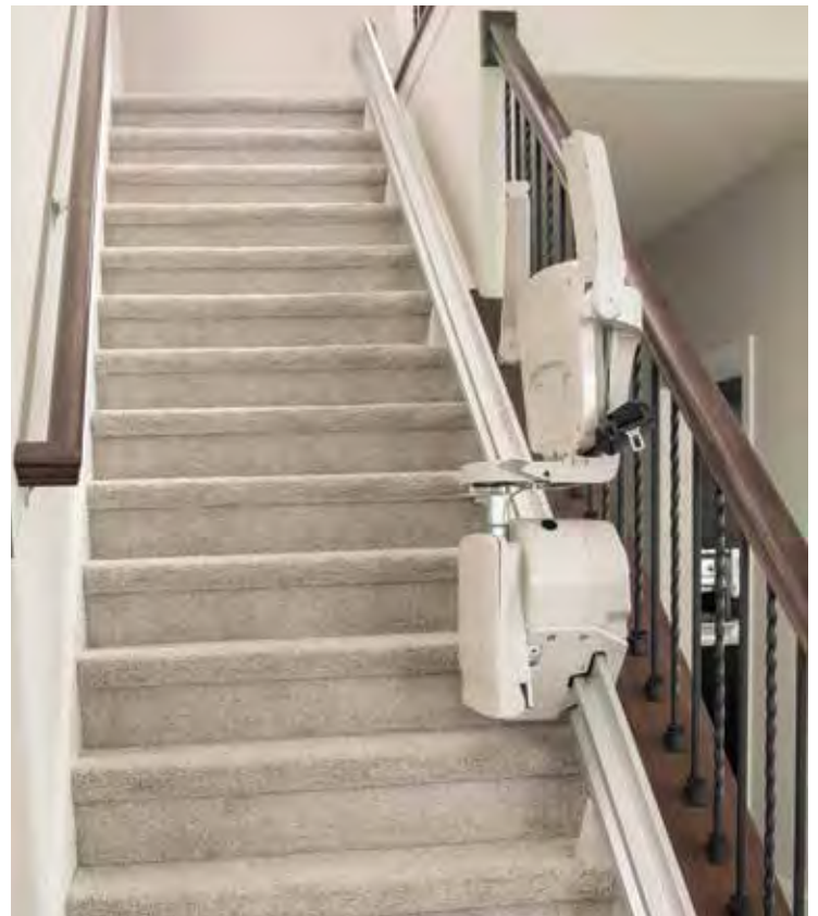
Compact design for open space on stairs.