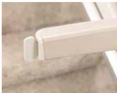
Ergonomic armrest control.