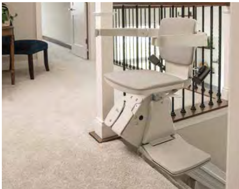
Offset swivel seat makes getting on/off easy.