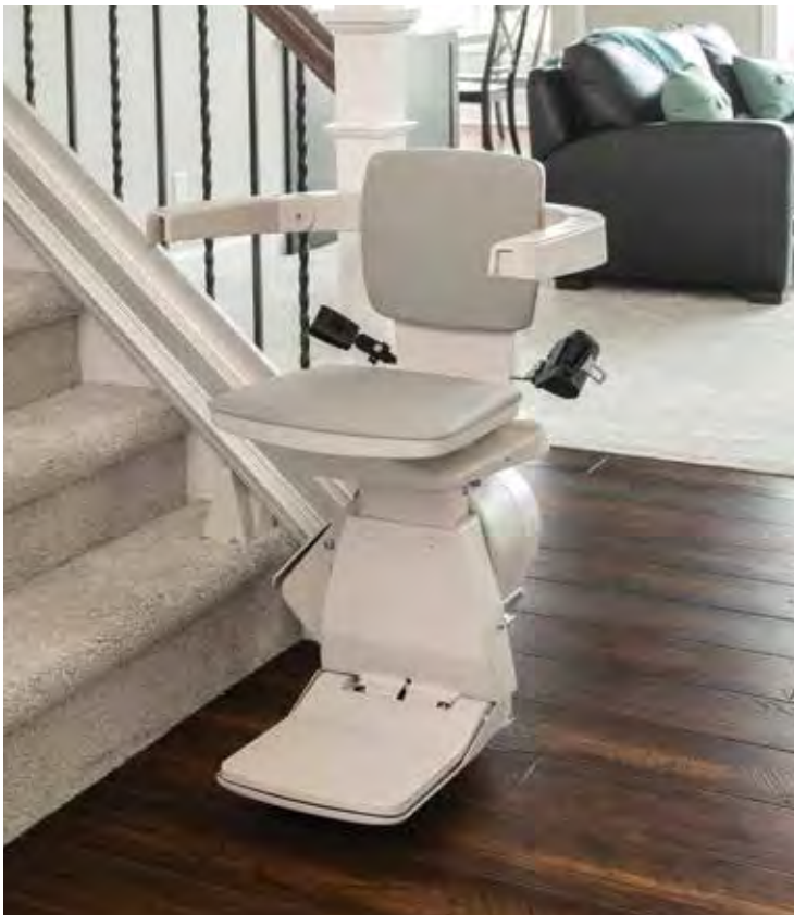
Padded, generous-size seat.