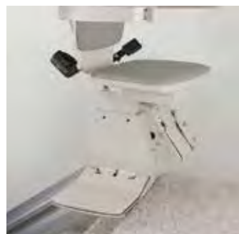
Power swivel seat for effortless exit. Armrest switch control or wireless call/send.