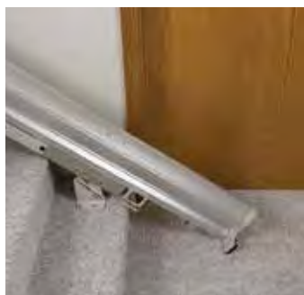
Manual or power folding rail for narrow hallway or when doorway is at the bottom of stairs. Manual operation or push button automatic.