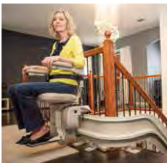
Top or bottom park position extends rail away from the staircase.