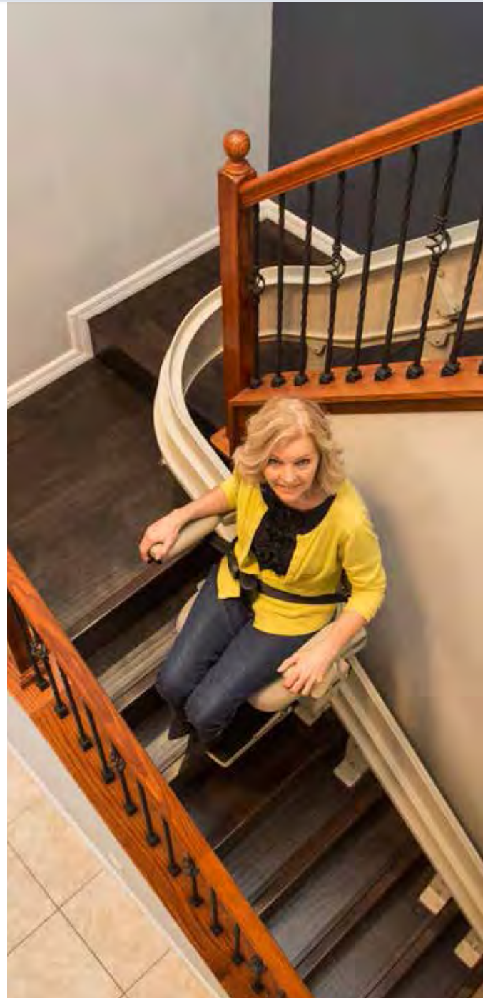
Crafted for a precision fit around curves.