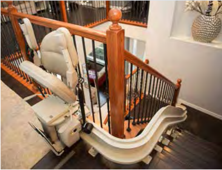
Custom made specifically for your home.