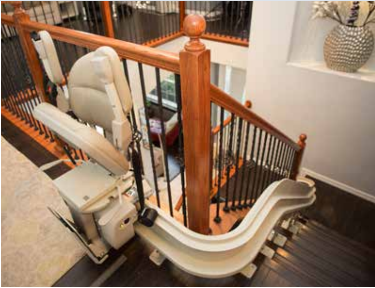
Custom made specifically for your home.