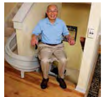
Mid-park and charge station for staircases with middle landings.