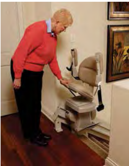
Manual offset swivel seat makes it easy to get on/off. Add the power seat option to make it effortless.