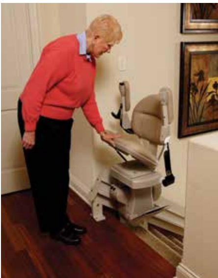
Manual offset swivel seat makes it easy to get on/off. Add the power seat option to make it effortless.