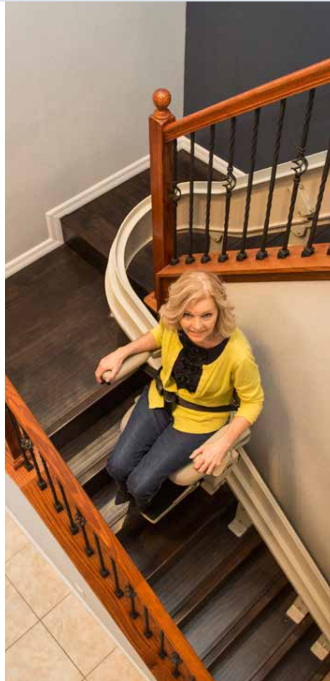
Crafted for a precision fit around curves.